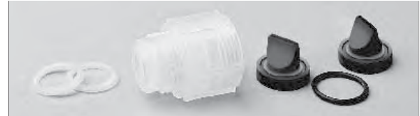
1" and 1 1/2" Bellows Kit

(Valve extension required only on suction port.)